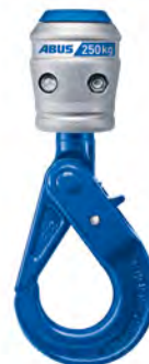
Safety load hook